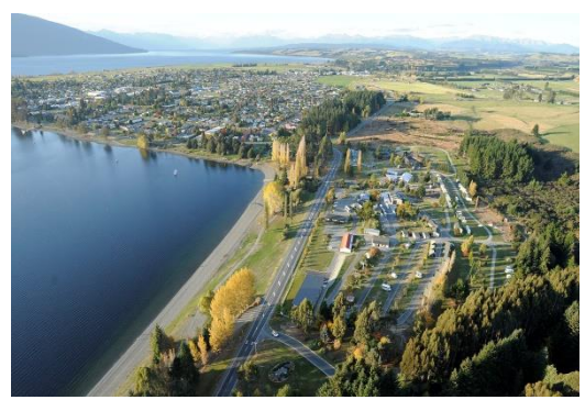
LAKESIDE TOWN OF TE ANAU