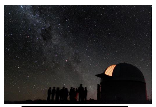
MT JOHN OBSERVATORY

Travel today to Tekapo, the location of the world's largest International Dark Sky reserve. You will arrive with time to explore the region and perhaps take a scenic flight over the Southern Alps in the afternoon and in the evening you have the option of visiting the Mt John Observatory on a guided tour with earth and Sky (pre booking essential)