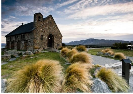
CHURCH OF THE GOOD SHEPHERD